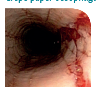
Mucosal fragility/tearing upon passage of the endoscope