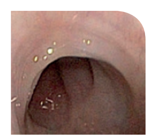
Seen as decreased vascular markings, mucosal pallor