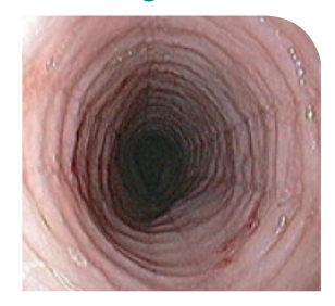
Also referred to as concentric rings, corrugated oesophagus, corrugated rings, ringed oesophagus, trachealisation