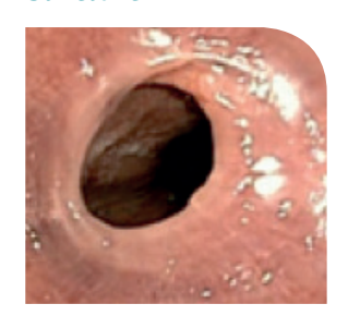
An abnormal narrowing