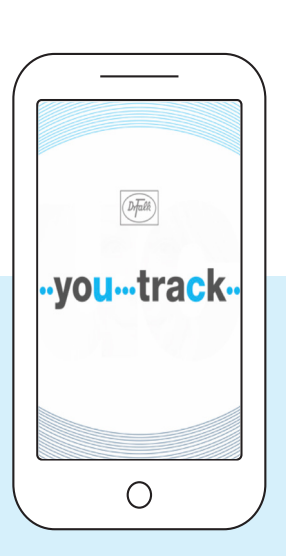
Symptom tracker app

Even if you start to feel better, it is very important to stick to your treatment routine. If you do find yourself missing doses, talk to your doctor or nurse – they are there to help. You can also download the you…track app from the App and Google Play store to help you stay on track with your treatment and monitor your symptoms.